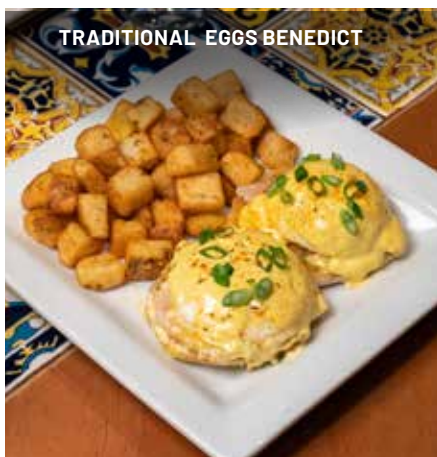
TRADITIONAL EGGS BENEDICT